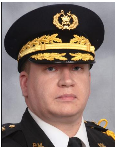
GENERAL EMIL R. SUDER GENERAL COMMANDING