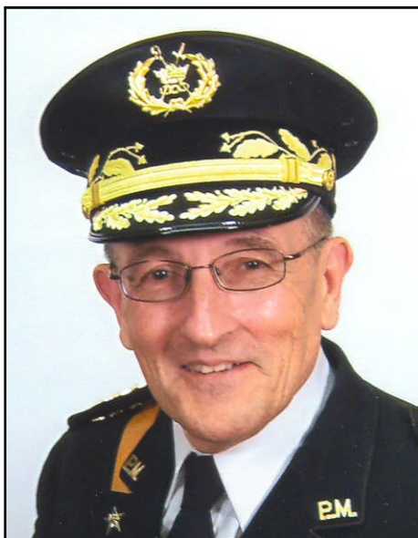
GENERAL DONALD E. MC LAREN GENERAL COMMANDING